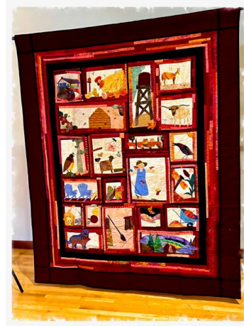
Presentation by the Comptche Quilters