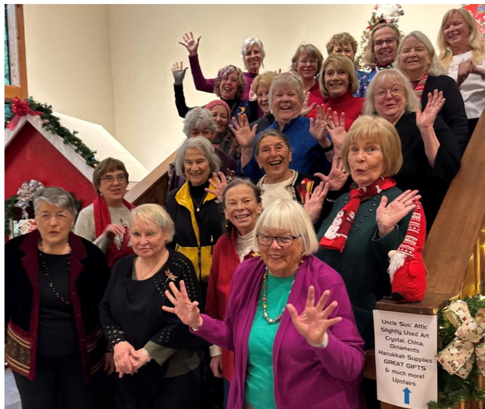
Happy Group at Holiday Luncheon