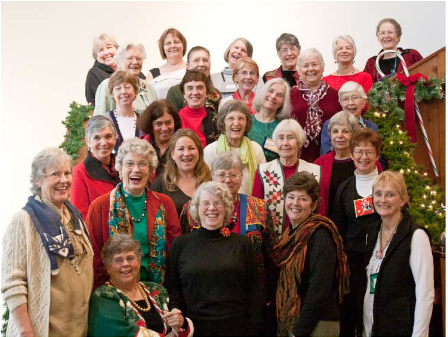
A merry band of quilters enjoyed the guild Holiday luncheon on December 12.