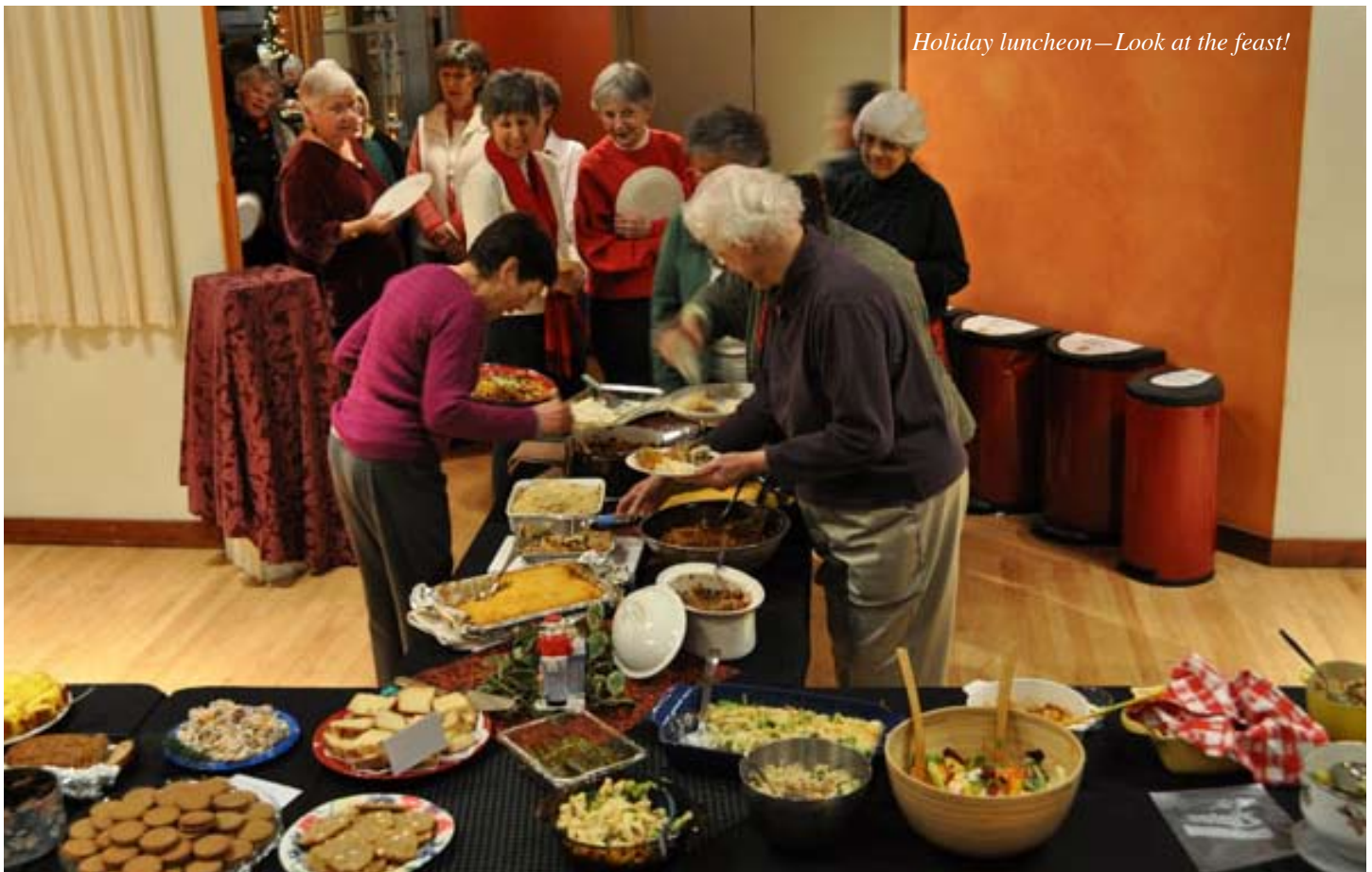
Holiday luncheon—Look at the feast!

PPQG membership dues should be paid on or before January 1, 2010. Please mail your check for $40 (or more with Angel Gift) payable to PPQG to :PPQG Membership, c/o Gualala Arts Center, PO Box 244, Gualala, CA 95445. Please make sure we are up-to-date on your contact information. Thank you for your support.