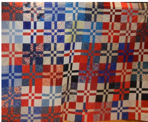
Disappearing Four Patch blocks made by those who attended the 2016 Retreat