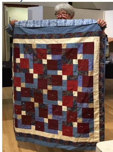
Polly Dakin – Comfort Quilt