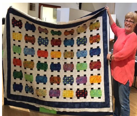
Sandy Hughes– Quilt for AIR sale