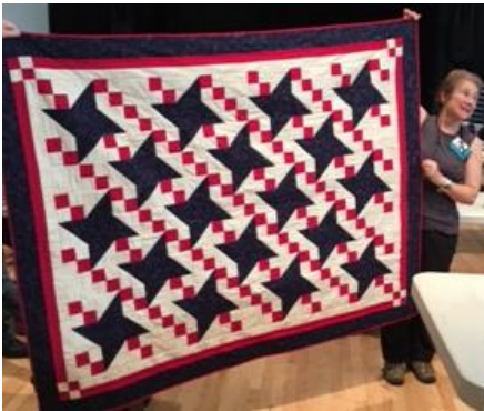
Dee Goodrich Quilt of Valor