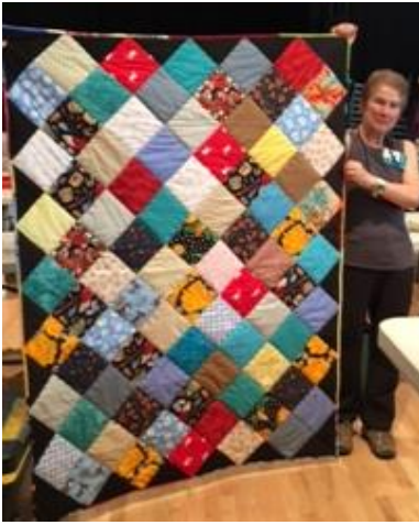
Dee Goodrich Comfort Quilt