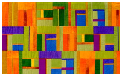
Second Place: Quilts Jo Dillon "Crayons"