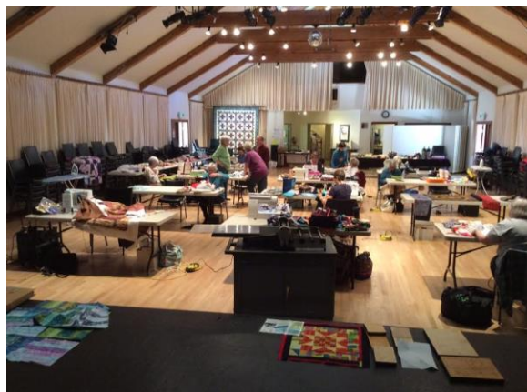
And this is how we work!