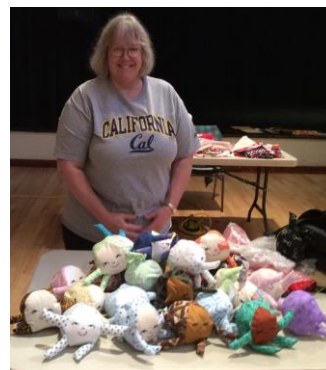
Humpty Dumpty by Francie Angwin