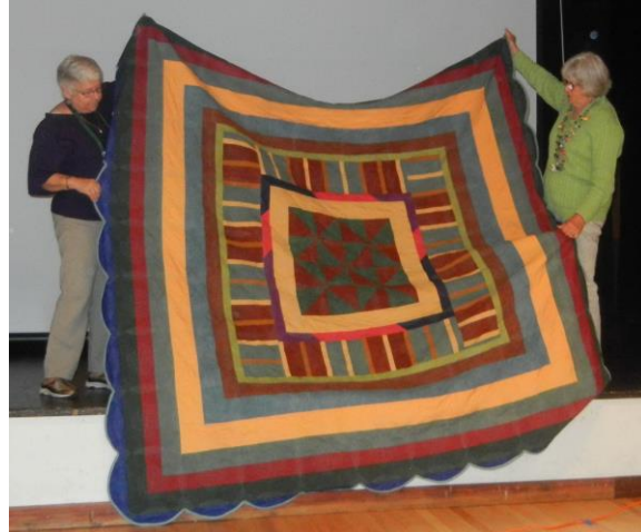
Back of the Double Wedding Ring quilt.